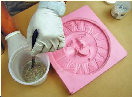
1. Mix Powder