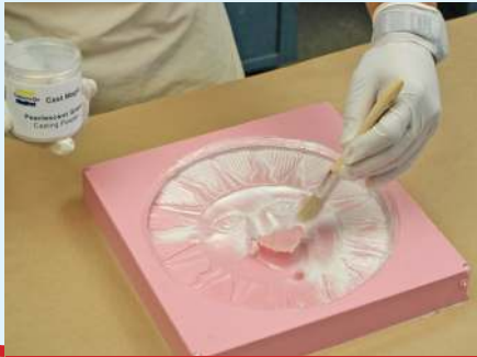
1. Powder Coat