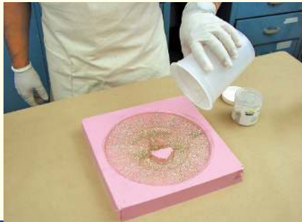
2. Cast Resin